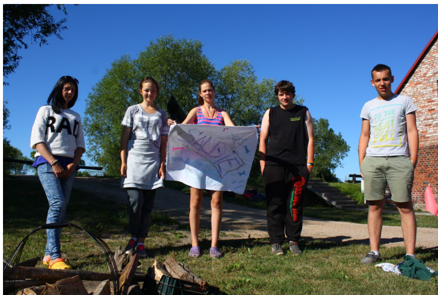
5. Image Group presentation.