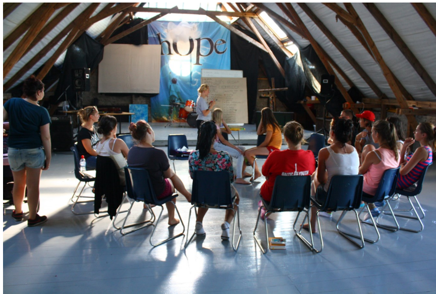
4. Image Being aware of the ministry goal.