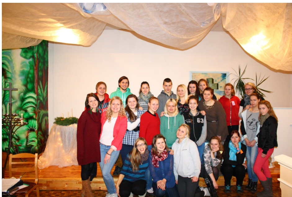
2. Image - Picture of participants