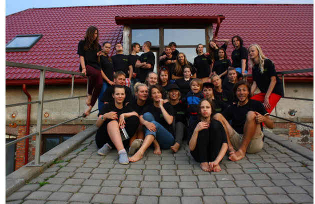
3. Image – Picture of youth camp „Switch!”