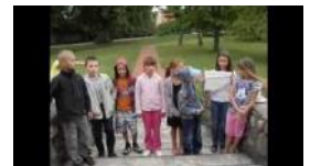
Watch Update on YouTube...