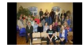
Watch Update on YouTube...