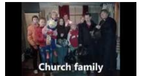
Watch Update on YouTube...