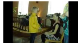
Watch Update on YouTube...