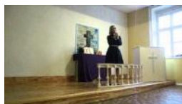
Watch Update on YouTube...