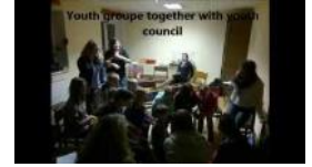
Watch Update on YouTube...