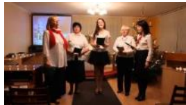
Watch Update on YouTube...