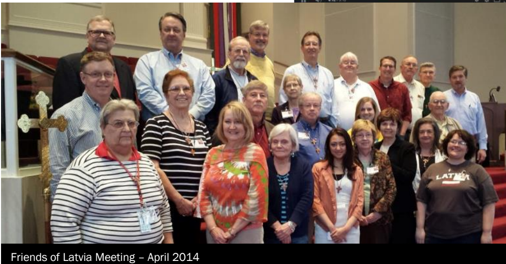
Friends of Latvia Meeting - April 2014