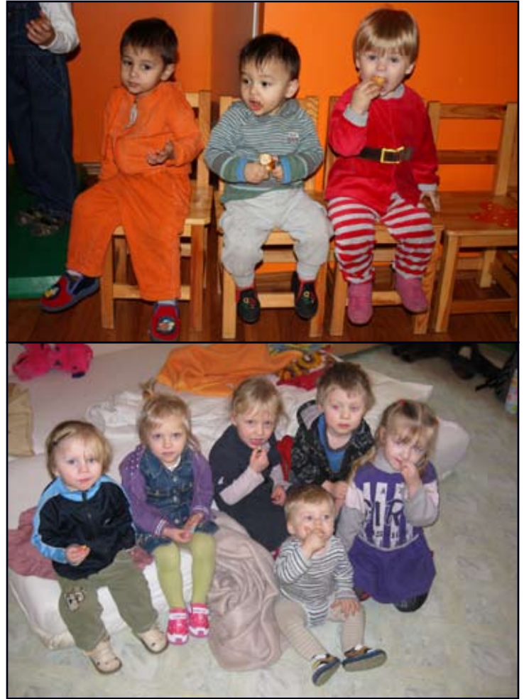
Bambi Room Children