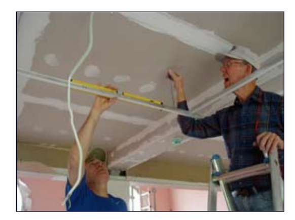
Beginning of ceiling

After the wallpaper and painting, our team installed a suspended ceiling.