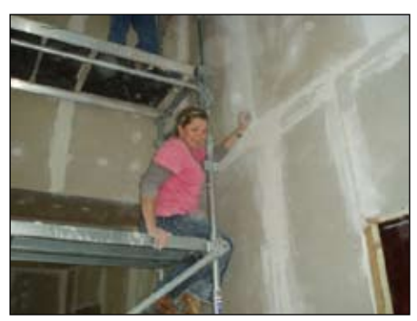
Sanding sheetrock walls

The task this year for our VIM Team was to complete sheetrock work, sand the mudded areas to provide a smooth surface for wall paper. Unlike the typical renovation of rooms in the USA, the Latvians cover the walls with paintable wallpaper and then apply paint. The paper provides a textured look for any room, but there is a lot of additional work required with this method of renovation.