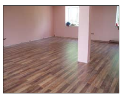
Completed floor in 2010