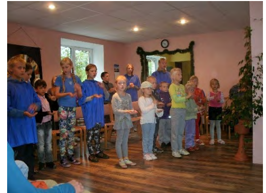
Children's summer camp at Liepa UMC.

At times you make a mess before making something better and this was the case on our recent trip. Days one and two were spent primarily stripping old, badly worn, mildewed wallpaper and carpet from 3 rooms and a small bathroom. Additionally, we removed a partial wall and door to give the existing hallway an easier flow thru for traffic.