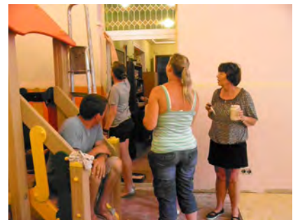
The Bambi Room before (above) and after (below)